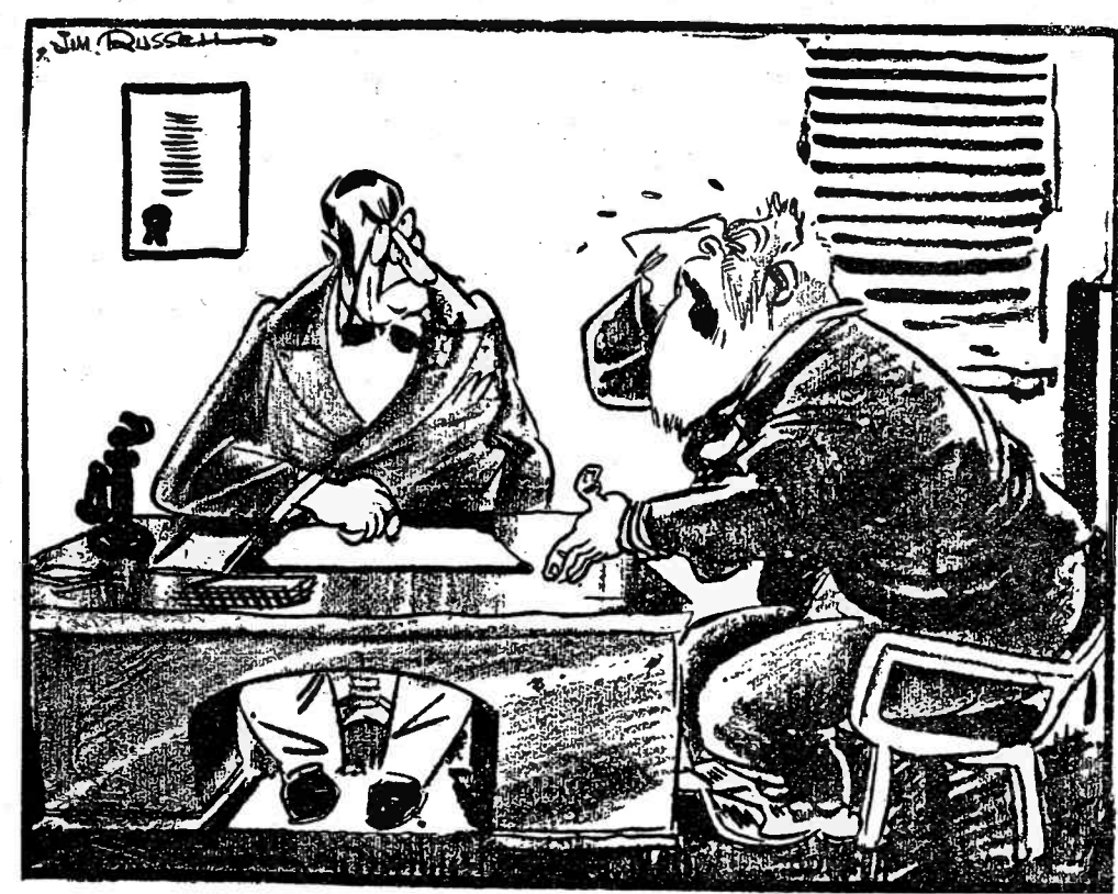
Farmer (to bank manager): Ar, don't be nasty to me. I've got no one to live for but you!

"When I was appointed, the banks came to me and told me they would personally pay me . . . . "